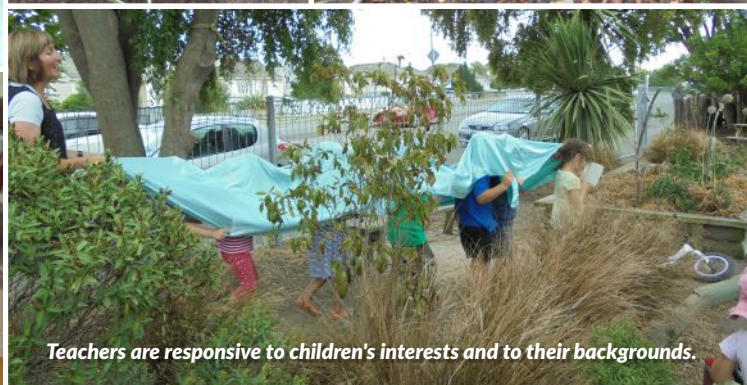
Teachers are responsive to children's interests and to their backgrounds.