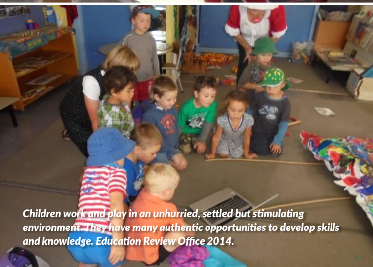
Children work and play in an unhurried, settled but stimulating environment. They have many authentic opportunities to develop skills and knowledge. Education Review Office 2014.