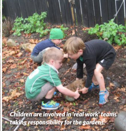
Children are involved in 'real work' teams taking responsibility for the gardens.