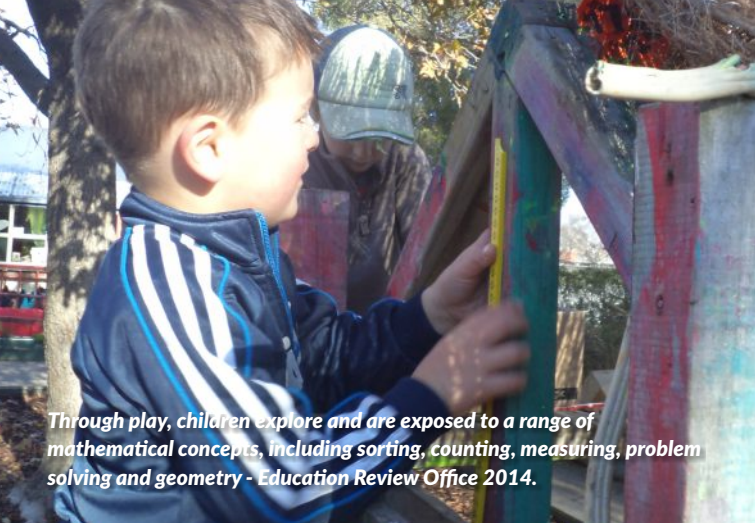
Through play, children explore and are exposed to a range of mathematical concepts, including sorting, counting, measuring, problem solving and geometry - Education Review Office 2014.