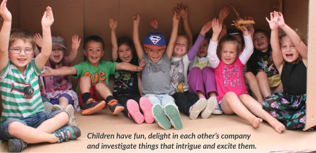
Children have fun, delight in each other's company and investigate things that intrigue and excite them.