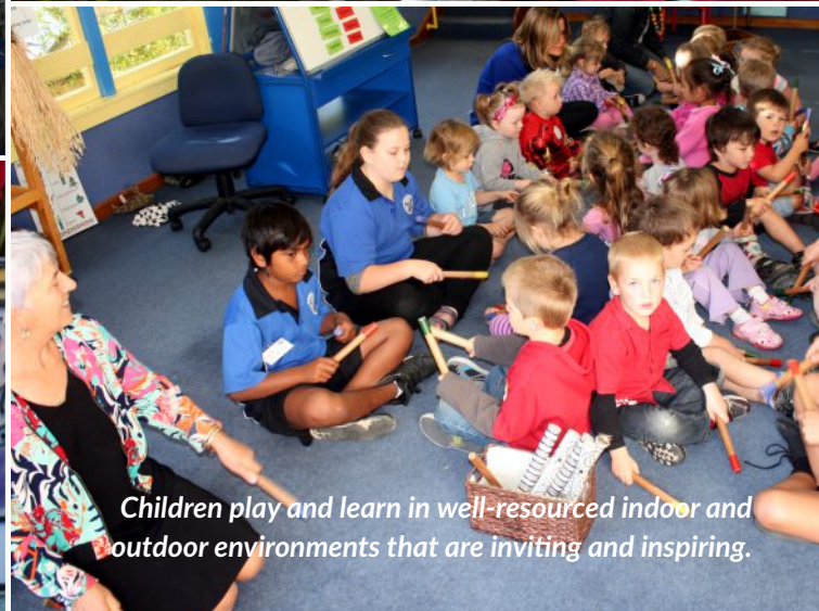
Children play and learn in well-resourced indoor and outdoor environments that are inviting and inspiring.