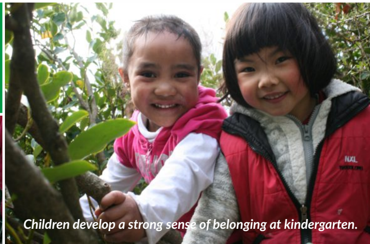
Children develop a strong sense of belonging at kindergarten.