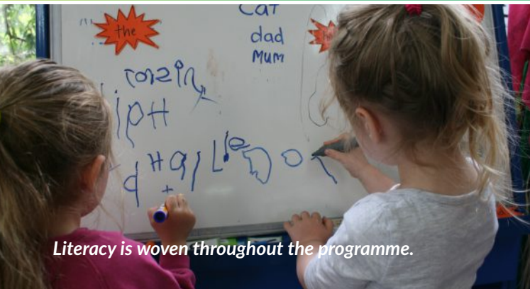
Literacy is woven throughout the programme.