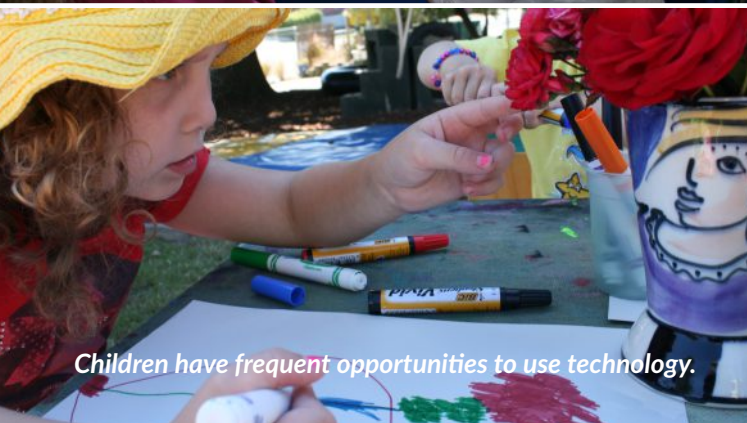
Children have frequent opportunities to use technology.